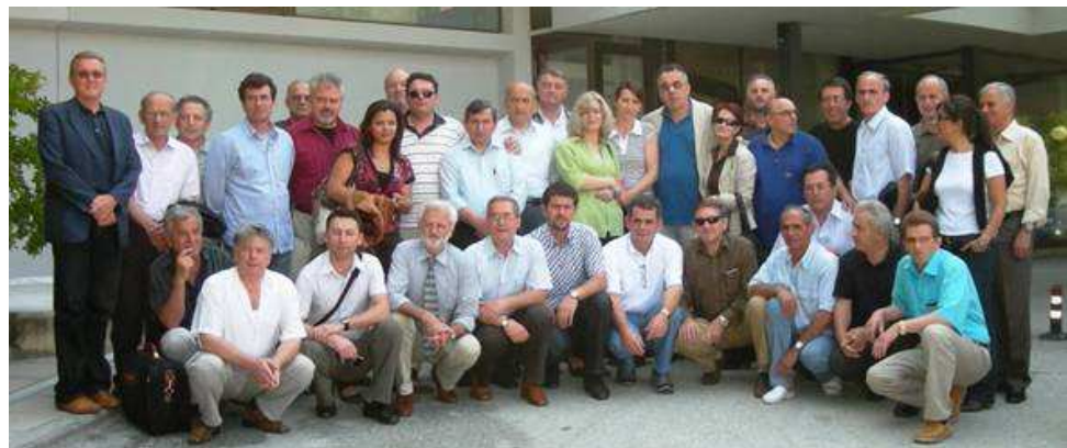
English training program

Charles Handy, "Finding Sense in Uncertainty", 1997